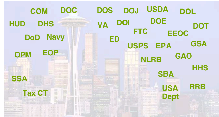
Seattle, WA: Jackson Federal Bldg