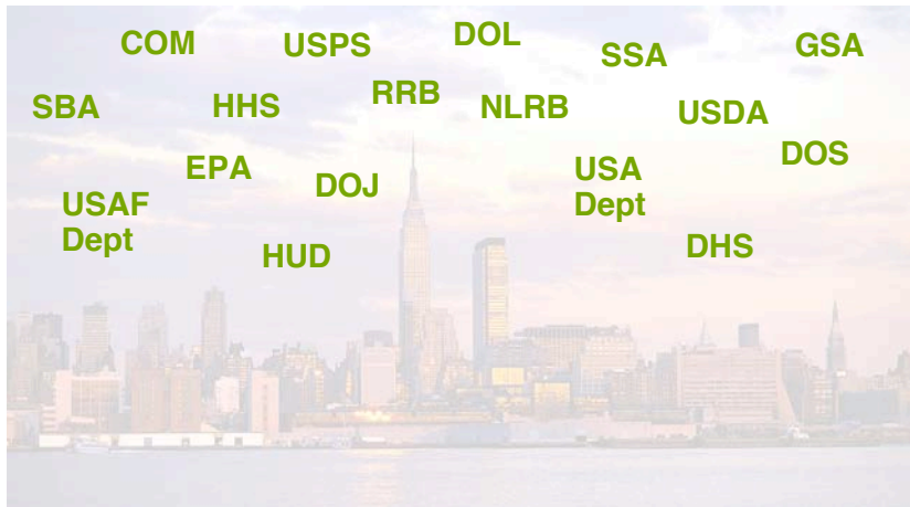
New York, NY: Javits Federal Bldg